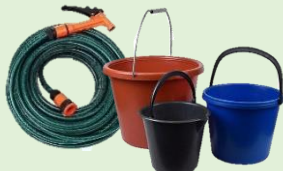
✓ Garden Tools & Equipment Hose, pot, plastic containers, buckets, small garden tools