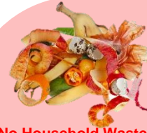
✗ No Household Waste or Food Scraps These items belong in your Residual Waste Bin (Red Lid)