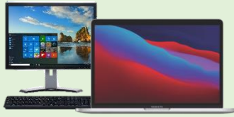
✓ Computers & Laptops