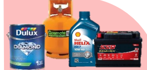
✗ No Liquids, Chemicals, Paint, Oils, Batteries or Gas Bottles Refer to Household Chemical CleanOut at cleanout.com.au