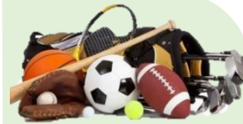
✓ Sporting Goods & Camping Equipment