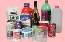
✗ No Recyclables These items belong in your Recycling Bin (Yellow Lid)