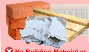
✗ No Building Material or Commercial Waste i.e. Timber, asbestos, concrete gyprock, sheet metal or bricks