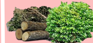
✗ No Garden Vegetation i.e. Grass, twigs, branches, tree stumps, dirt or rocks