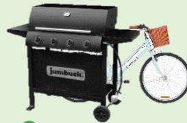
✓ Small Scrap Metal Items Under 1m3