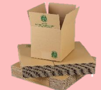
✗ No Flatpack Cardboard