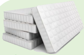
✓ Mattresses or Ensembles/Bases