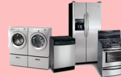
✗ No Large Appliances See the White Pages for removal services