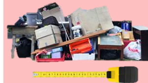
✗ No items greater than 2m in length or too heavy for two people to safely lift