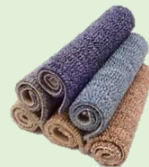
✓ Rugs & Carpet Scraps Pieces must be less than 2m in length