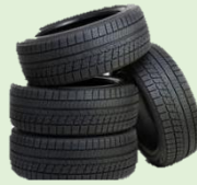
✓ Tyres Car/Motorbike only