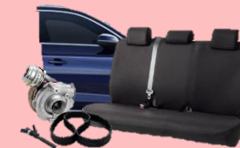
✗ No Car Parts