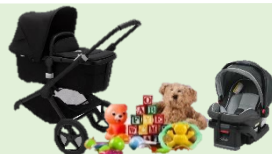
✓ Baby Items & Toys Pram, bassinet, stroller, baby bath, car seat and toys