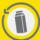
Milk & Juice Cartons