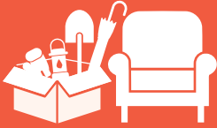
PILE 1 LANDFILL

Two collections are available per financial year for households to dispose of larger items unfit for charity.