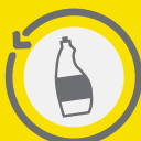
Rigid Plastic Containers including Lids