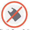
Plastic Bags, Soft Plastics & Biodegradable Bags