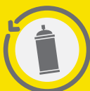
Steel & Aerosol Cans