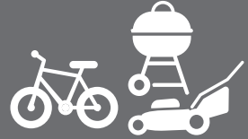
PILE 3 SCRAP METAL

Mattresses, tyres, metal and e-Waste are collected for recycling and must be placed in a separate pile. All other items are sent to landfill - nothing is recovered .