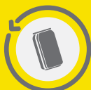
Aluminium Cans, Trays & Clean Foil