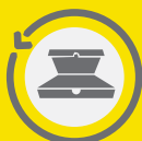
Unsoiled Paper & Cardboard