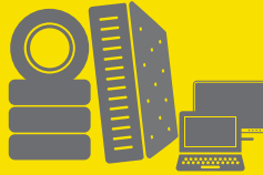
PILE 2 RECYCLING